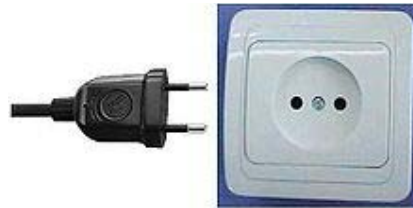
Figure 3 - Type C (Europlug) plug and socket