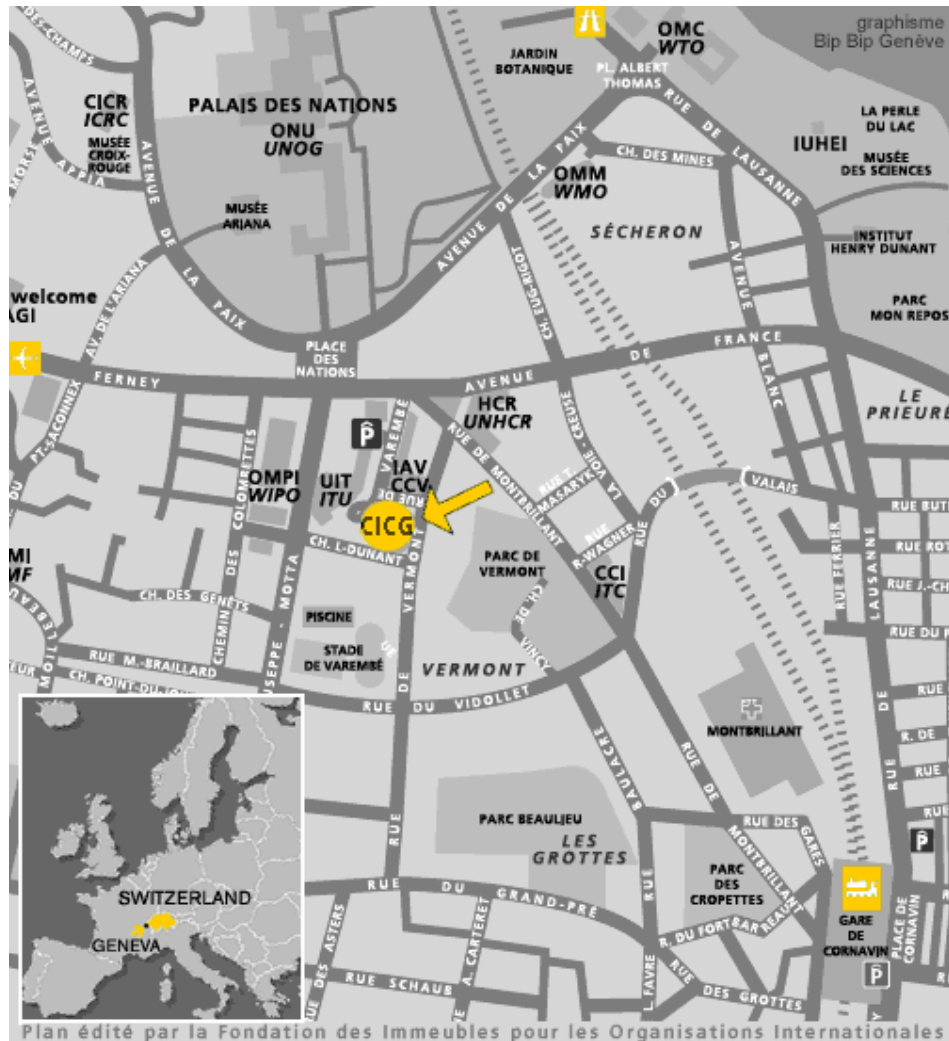
Figure 1 – Map of Geneva highlighting the conference centre, United Nations Office at Geneva and main train station.