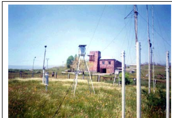
Figure1: Weather Station "Amberd"

The measurements of other gases are not produced.