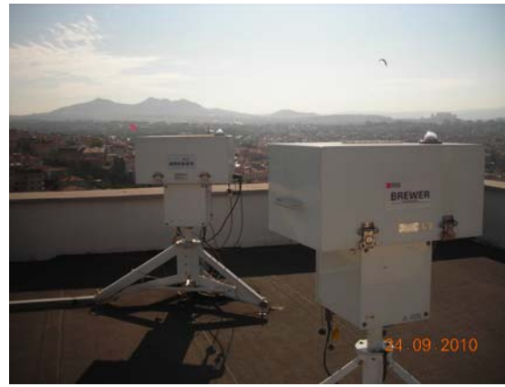
Figure 2. Second calibration of Brewer MKIII #188 with the reference Brewer MKIII #158 in Ankara station.

Second Brewer S. calibration was carried out by Kipp& Zonen on 22–29 September 2010. Kipp& Zonen used Brewer Ozone Spectrophotometer #158 as a reference instrument in Ankara station.