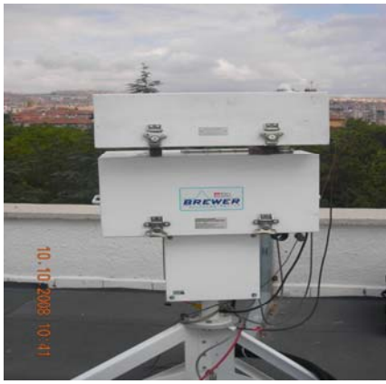
Figure 1. First calibration of Brewer MKIII #188 with the reference Brewer MKIV #017 in Ankara station.