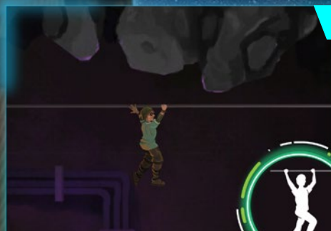
2D Platform Runner Game