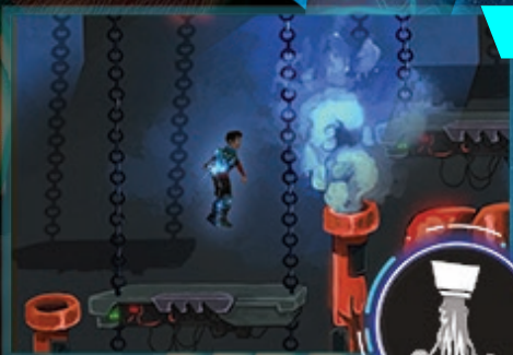
2D Platform Runner Game