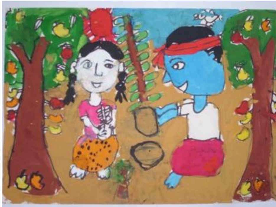
Picture- 17: Amlan Sarker a five year old boy was selected first in the Painting Competition in Group-A on the eve of International Ozone Day, 2012.