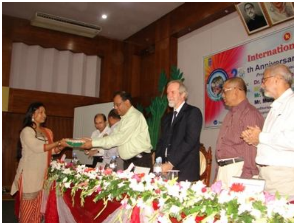
Picture - 10: Hon'ble State Minister for Environment and Forest is handing over crest to The Poster Competition winner.