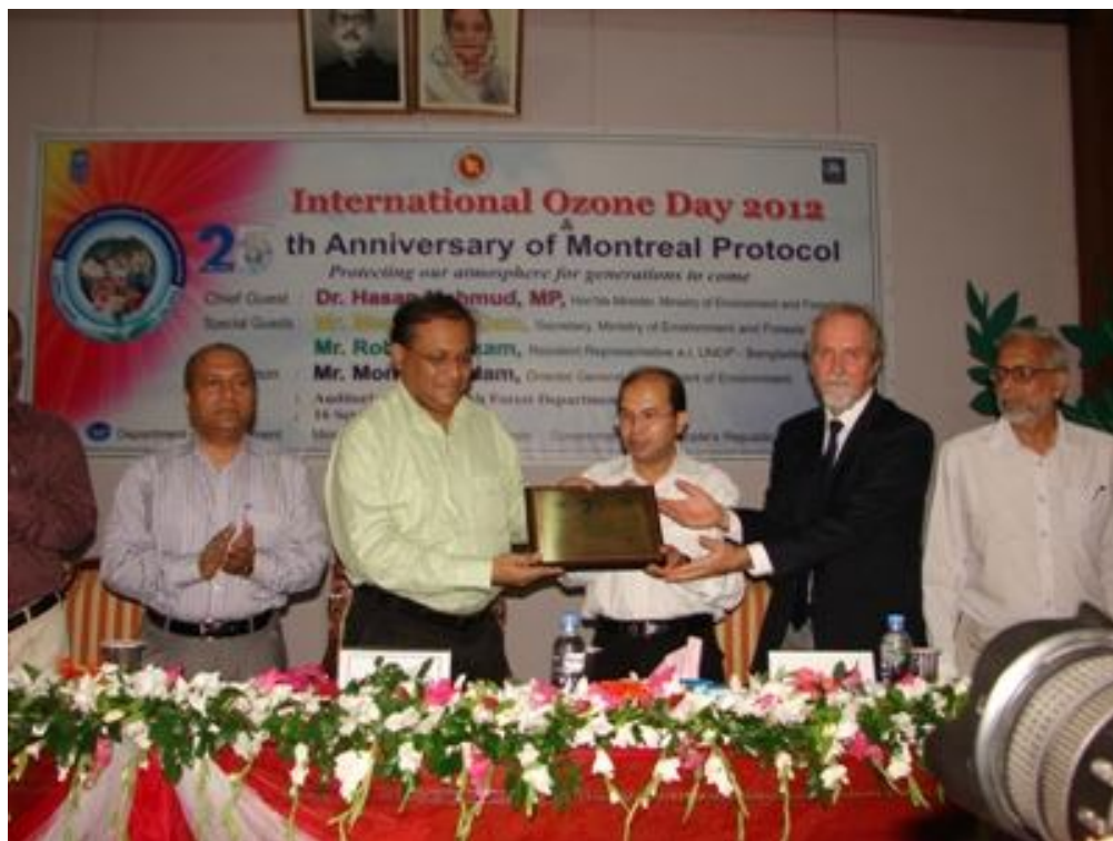
Picture -12: Handover ceremony of Crest of Appreciation from the Ozone Secretariat.