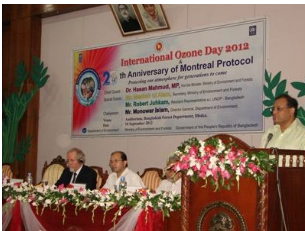
Picture - 2: Hon'ble Minister for Environment and Forest is delivering his speech to the audience.