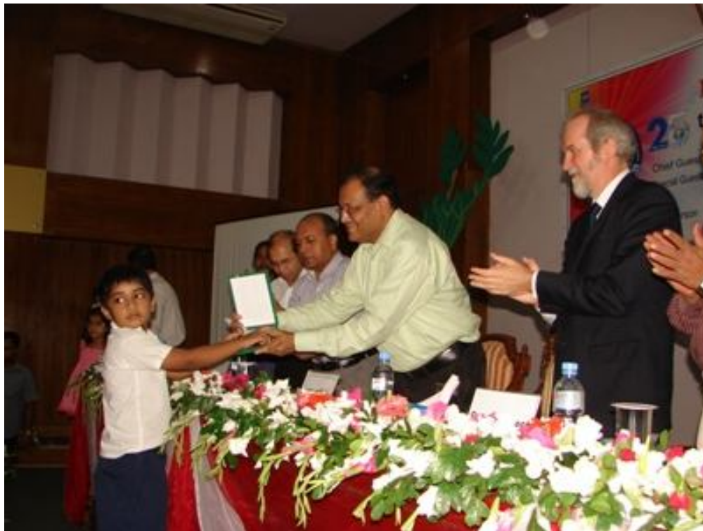
Picture - 8: Hon'ble State Minister for Environment and Forest is handing over crest among one of the winners of Paining Competition.