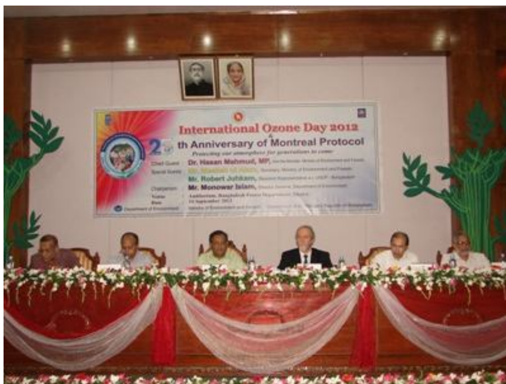
Picture - 01: Dr. Hasan Mahmud, MP, Hon'ble Minister, Ministry of Environment and Forest was the chief guest of the seminar.