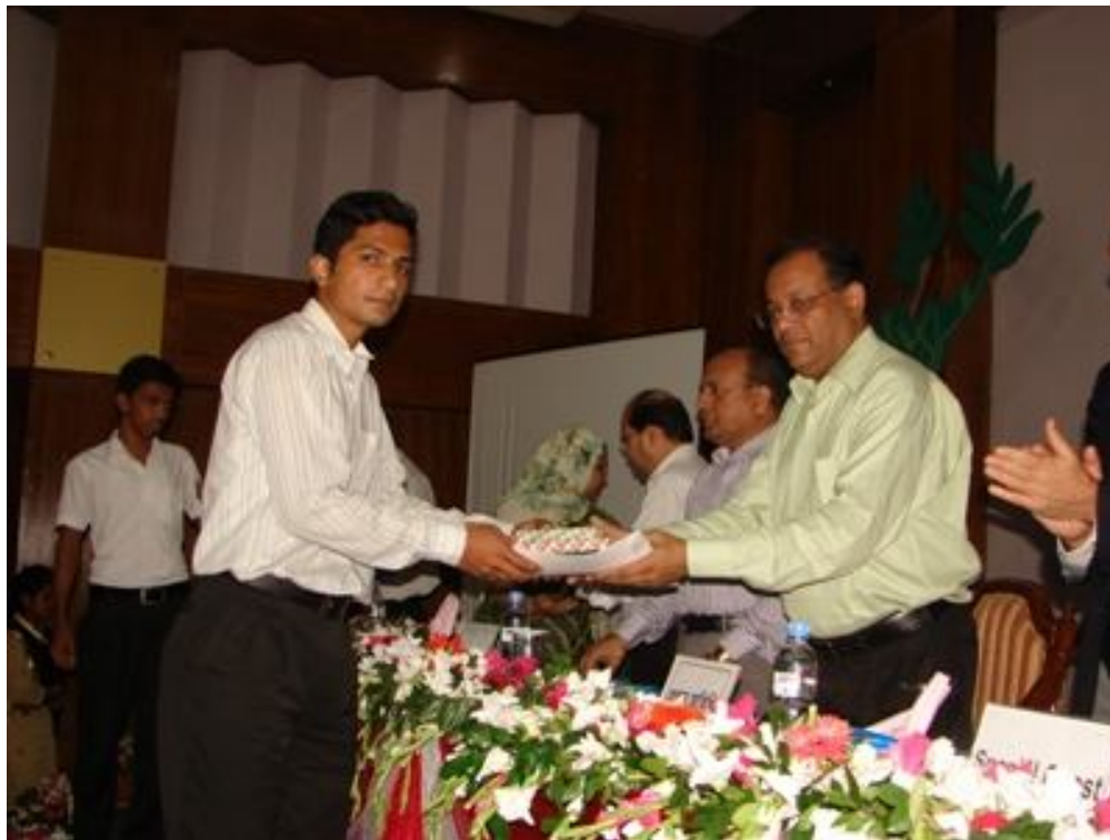
Picture - 9: Hon'ble State Minister for Environment and Forest is handing over crest among one of the winners of Essay Competition.