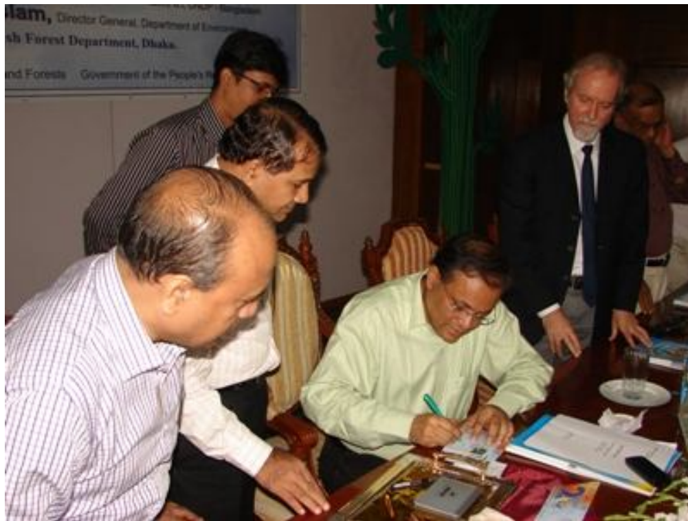
Picture - 11: Hon'ble Minister for Environment and Forest is releasing the commemorative stamp.