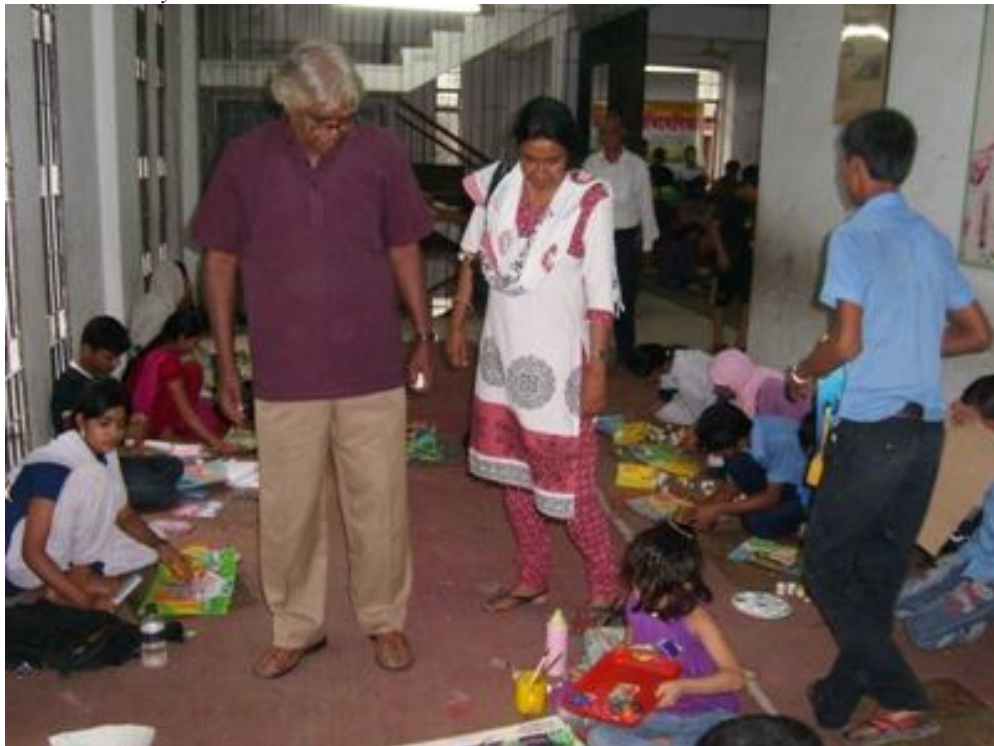
Picture- 16: Painting Competition organized by Department of Environment on the eve of International Ozone Day, 2012.