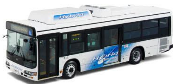
Roof mounted electrically driven bus MAC system