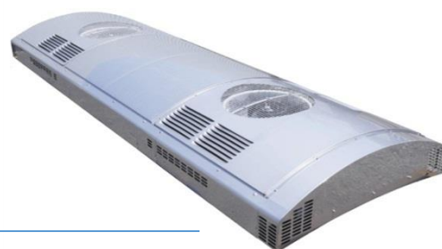
Roof mounted electrically driven train MAC system