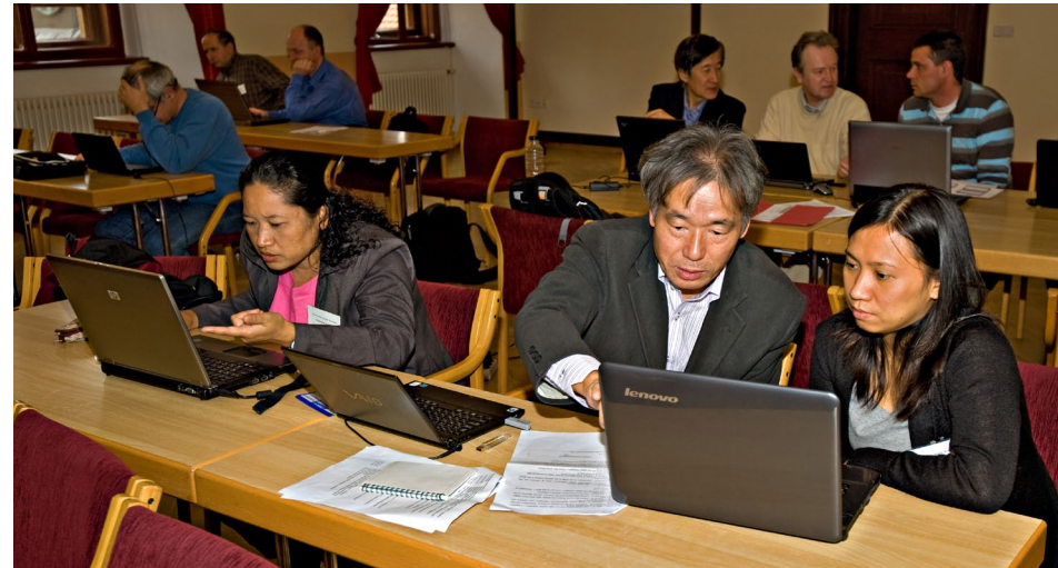
Data analysis workshop, Czech Republic, 2011