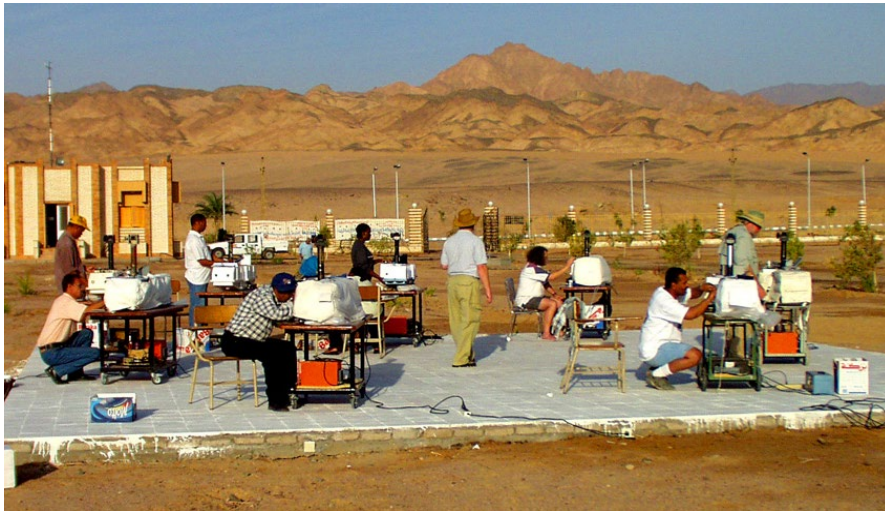
Dobson intercomparison in Egypt, 2004