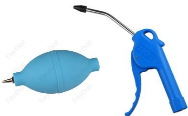
Hand pumped air dusters