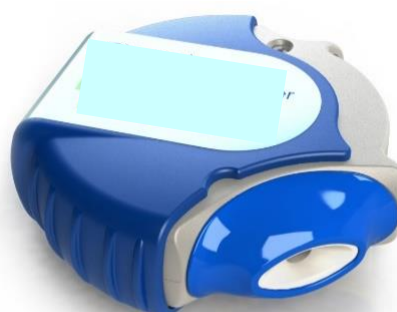
Dry powder inhaler for respiratory drugs