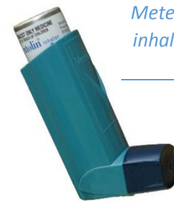
Metered dose inhaler (MDI)

In a number of aerosol applications there are competing products based on “not-in-kind” technologies, such as hand-pumped sprays, roll-on liquid products (e.g. for deodorants) and non-sprayed products (e.g. for polishes and lubricating oil). Aerosols are often favoured because of ease of use, even though they may be more expensive than some competing technologies. In the medical field, drugs for respiratory diseases can be delivered either by aerosols (MDIs) or through inhaled powders. Most drugs available as an MDI aerosol are also available as a dry powder inhaler (DPI).