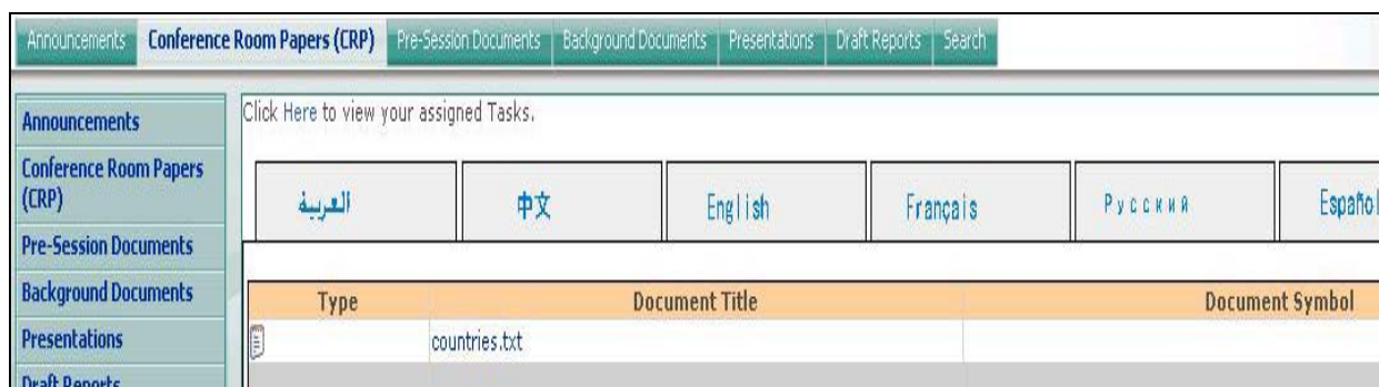
Figure 3 – Conference-room papers, pre-session documents and draft reports will be presented in the six official United Nations languages

14. Conference-room papers, pre-session documents and draft reports will be presented in the six official United Nations languages. Participants can access documents in their preferred language by selecting the appropriate tab.