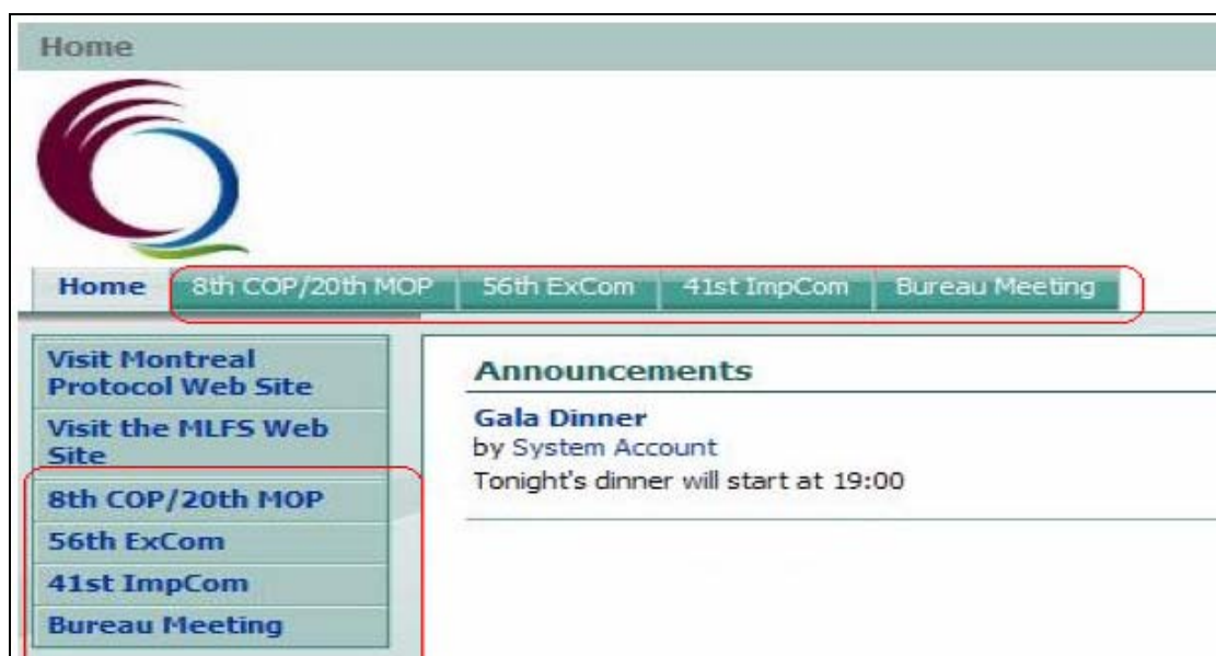
Figure 2 – Main conference home page