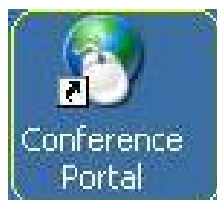
Figure 1 - Icon for accessing the system for paperless meeting

11. The desktop of the issued laptops will include an icon labelled “Conference Portal”, similar to the one depicted in figure 1, which can be used for accessing the system. In addition, and especially for participants using their own laptops, any browser may be used with the web address http://unepserver/ for accessing the system at the meeting venue: