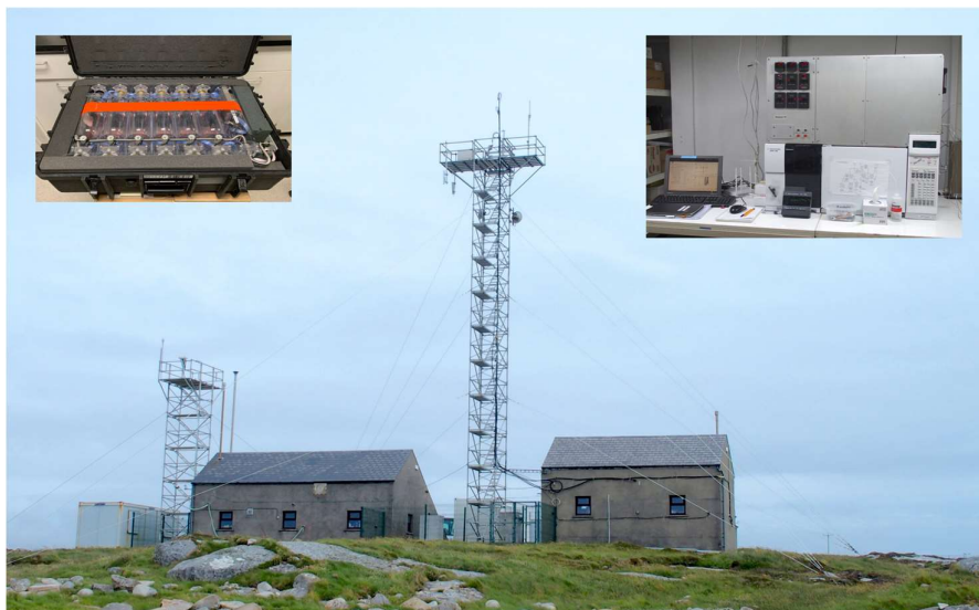
Figure 2. Atmospheric monitoring station at Mace Head, Ireland. AGAGE high-frequency measurements of substances controlled by the Montreal Protocol are made by automated gas chromatography with mass-spectrometric detection (GC/MS) on air pumped from the central tower. The upper right inset shows a similar GC/MS instrument at the Gosan monitoring station, Jeju Island, South Korea. The upper left inset shows a NOAA automated 12-flask air sampling system used to collect samples at stations around the world for subsequent GC/MS analysis in the central NOAA laboratory.

Flask sampling locations (Figure 2) have also enabled the mapping of emission locations and magnitudes across regions with the use of inverse modelling techniques. While daily flask sampling may provide lower resolution for modelling emissions around any one site compared to higher-frequency measurements from an in-situ instrument, multiple flask collection sites can provide extensive geographic coverage for estimating emissions. Flask sampling at many locations or in airborne programmes also can provide exploratory geographic coverage in presently unsampled or under-sampled areas of interest at lower cost. Flask samples collected at in situ high-frequency measurement stations can also be used to assess potential biases among different measurement programmes. And larger flask samples can be archived for future measurements with advanced technologies that exceed current capabilities, thereby enabling the detection of new compounds and the measurement of isotopic composition to diagnose sources and mechanisms of production and destruction.